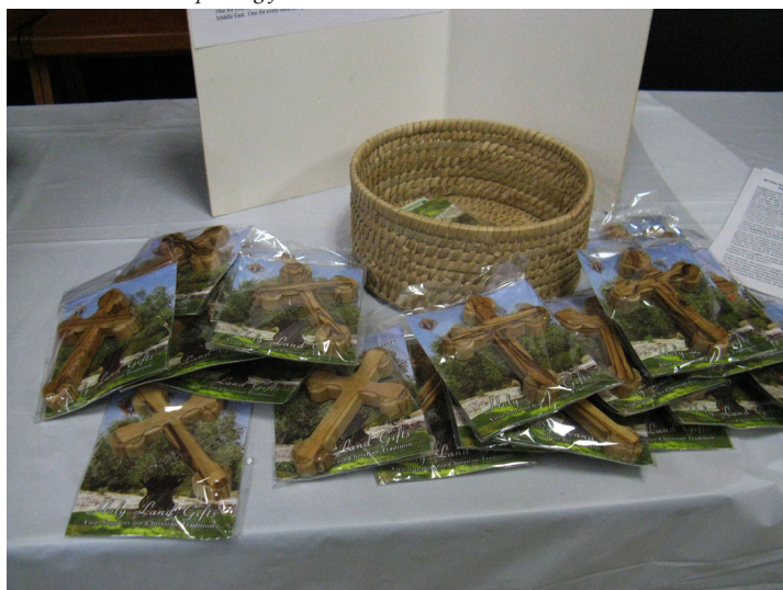
The wooden Crosses were available to purchase at the party.