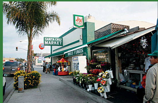
GOLETA 5757 Hollister Ave.