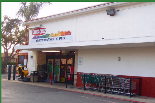
SANTA BARBARA 324 W. Montecito St.