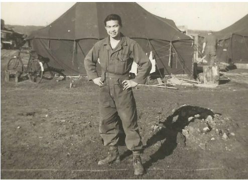
Behind him was a fox hole use only when enemy plane over field. Look at all that hair had!