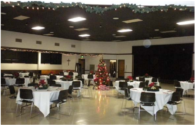
The hall decorated before the start of the party.