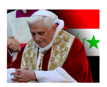
BENEDICT XVI St Peter's Square First Sunday of Advent, 28 November 2010