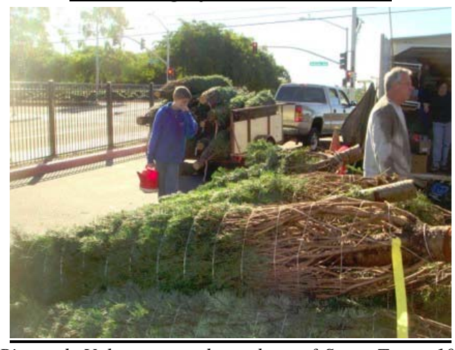
Pictured: Volunteers and members of Scout Troop 105 unloading Christmas Trees and setting up the booth for Christmas tree sales