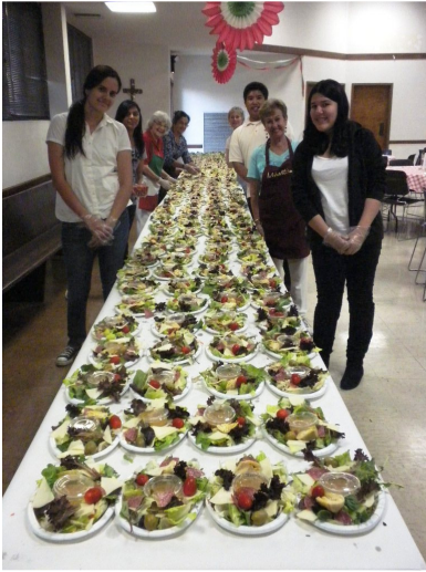
Students and KC family members volunteers getting the salads ready to serve.