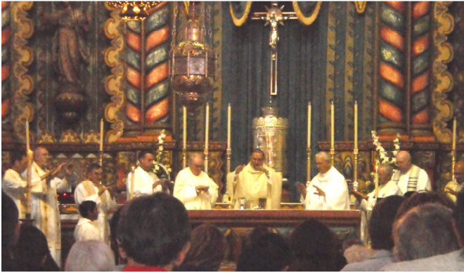
Cardinal Roger Mahony with all the priests at the altar.