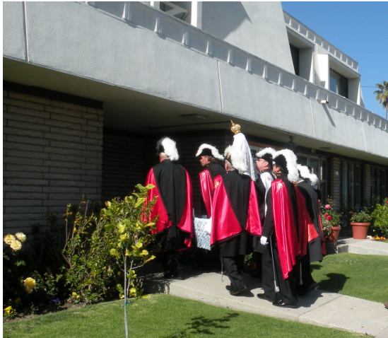
Color Corps wraps up the procession at St. Mark's Church.