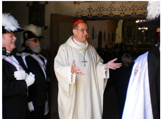
Cardinal Roger Mahony talking with the rest of the Color Corps.