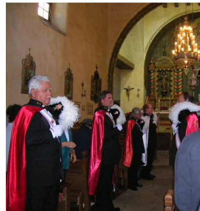
Color Corps standing at attention waiting for the Archbishop and their entourage to come inside the Church.