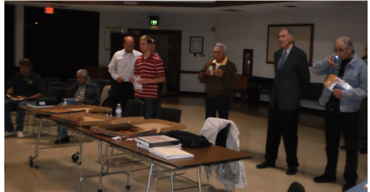
Council members enjoying pizza after the exemplification was over.