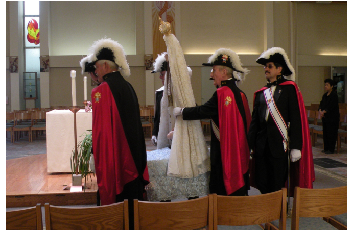
Color Corps presents the Our Lady of Fatima statue in front of the altar at St. Mark's.