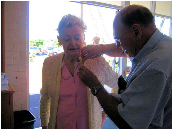
A faithful Knight pinning an orchid on a mother.