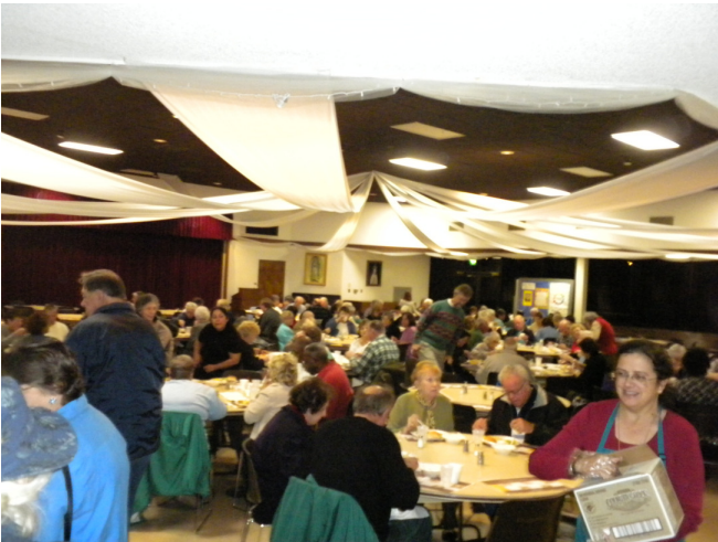
Pictured: The first week of the Lenten Fish Fry held at the St. Raphael's Parish Hall.