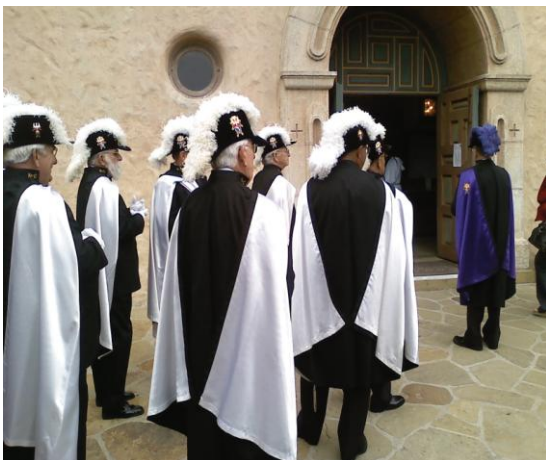
The Color Corps is following the Corps Commander into the Church.