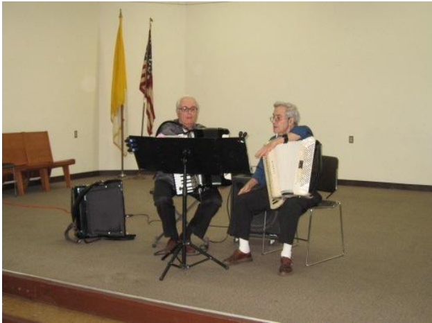
The accordion band finding their next musical number to play for the guests.