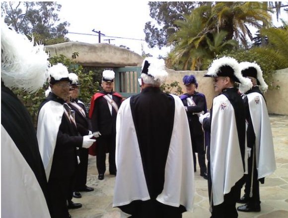
The Color Corps is assembled in front of Our Lady of Mount Carmel Church.