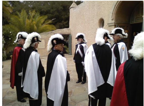
The Color Corps fall into formation.