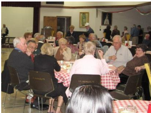
Everybody is excited to celebrate Festa Italiana!