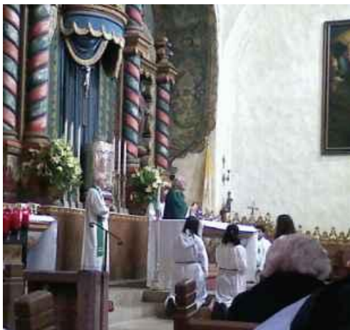
Bishop Thomas Curry celebrating the Eucharist at Our Lady of Mount Carmel Church.