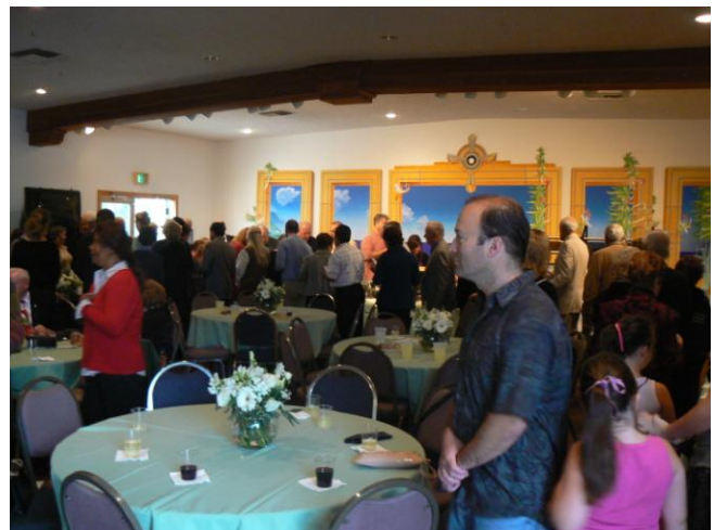
The guests lining up to eat.