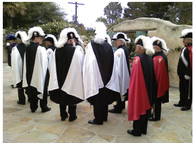
The Color Corps is getting into formation.