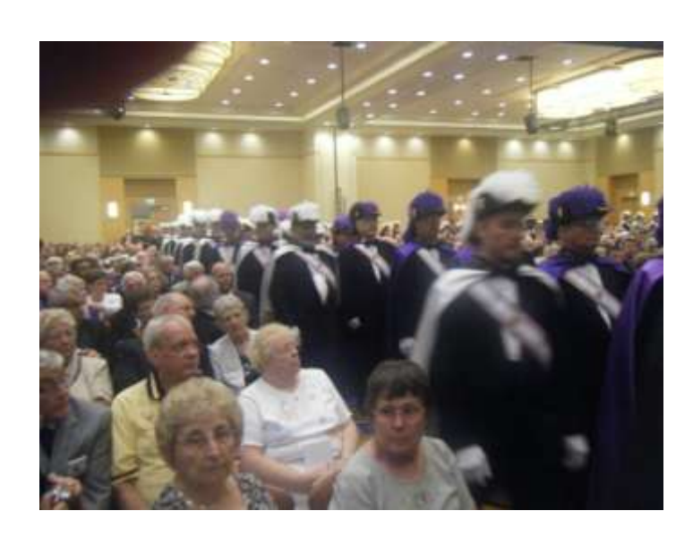
Parade of Corps Commanders and Navigators on the ballroom floor.