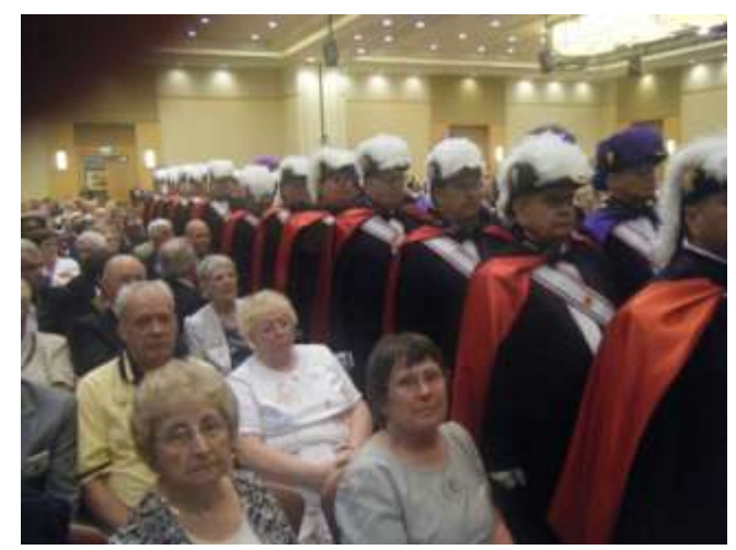
Parade of SKs on the hotel ballroom floor.