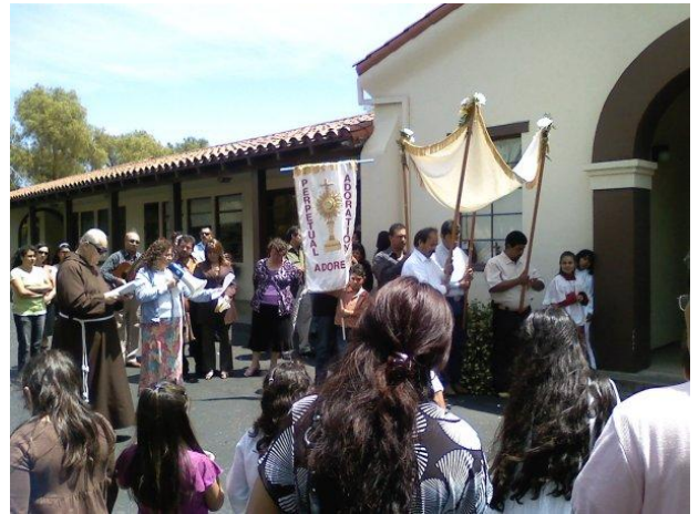
Corpus Christi procession at Mission Santa Inez.