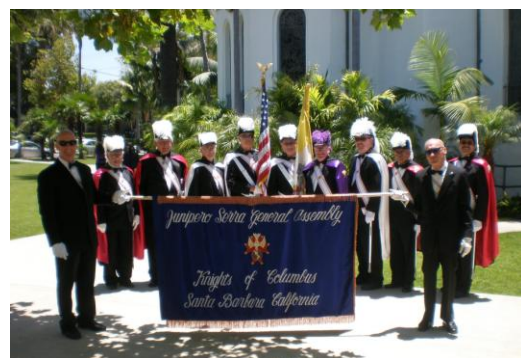
Pictured: 4 th Degree Color Corps before the July 4 th Parade at OLS Gardens.