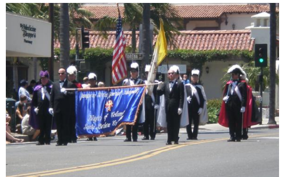
Pictured: 4 th Degree Color Corps marching down State and Micheltorena Streets.