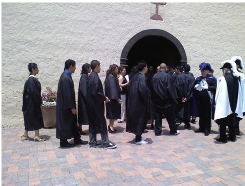
4 th Degree Color Corps with graduates of Santa Ynez High School at Mission Santa Inez.