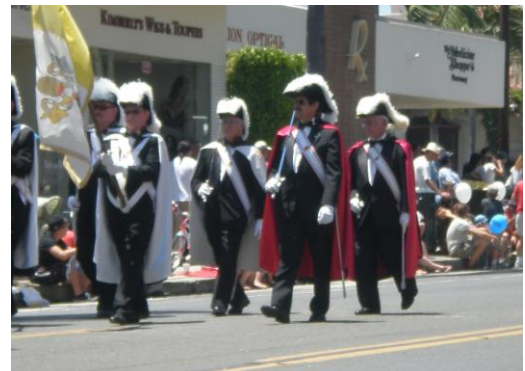
4 th Degree displaying the colors before a spellbound 4 th of July audience.