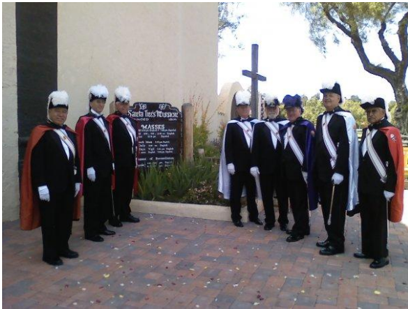
4 th Degree Color Corps at Mission Santa Inez.