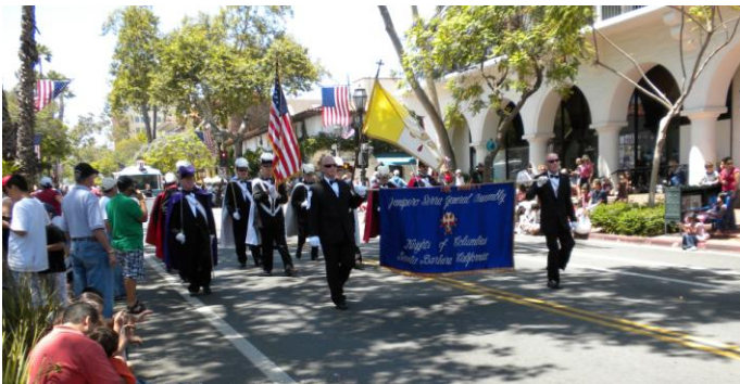
4 th Degree Color Corps marching through Downtown State Street on the 4 th of July.