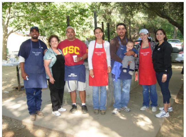
The group of volunteers that helped in cooking and serving the delicious food for the Memorial Day picnic.