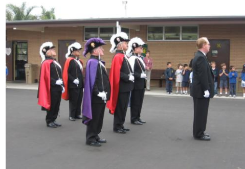
Pictured: 4 th Degree Color Corps at Flag Presentation Ceremony, St. Raphael's School on May 28 th .