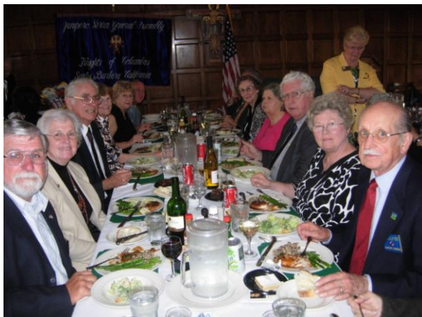
Pictured: (Left to Right) Distinguished Sir Knights from the 4 th Degree with their wives enjoying a delicious meal at the Old Mission