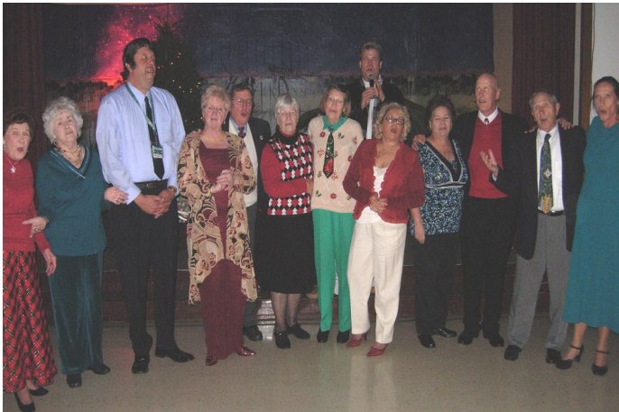
Assorted guests singing Christmas Carols.