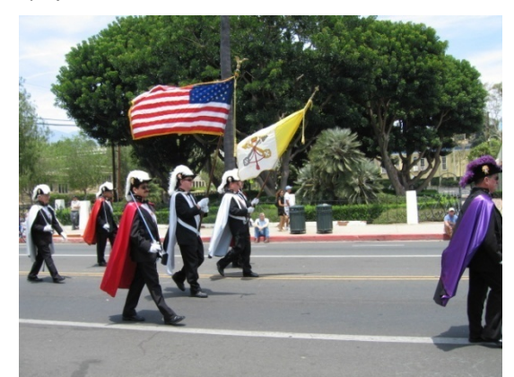
The Color Corps start their march down State Street at the Carry Sword position.