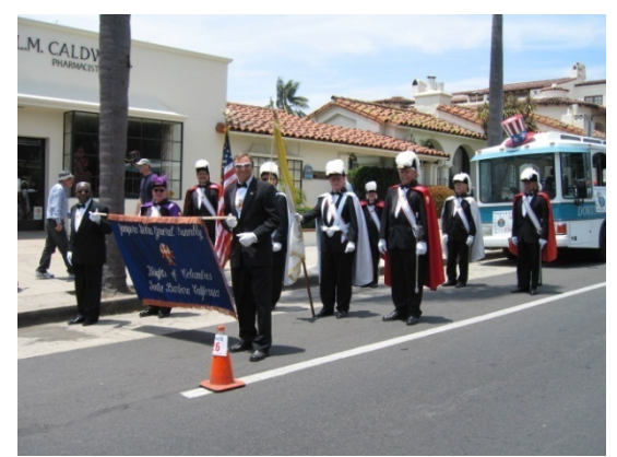
The Color Corps assemble just prior to the march.