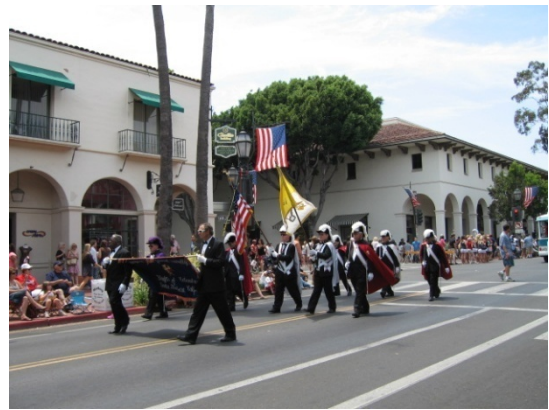
Another picture of the Color Corps as they continue