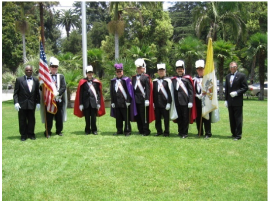
Another picture of the Color Corps on the lawn at Our Lady of Sorrows Church.