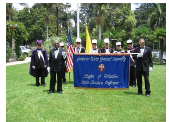
The Color Corps pose for their picture before the July 4 Parade.