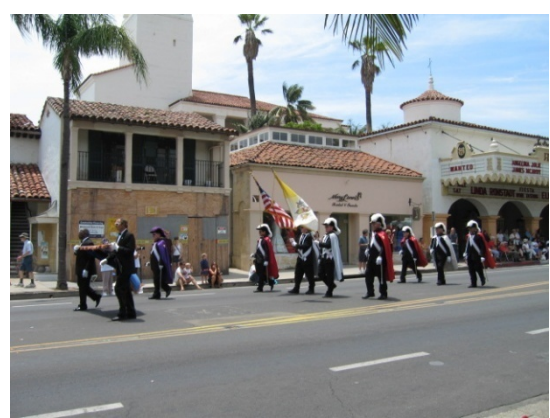
The Color Corps march past the Arlington Theater.