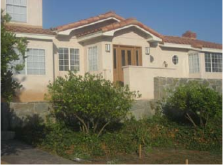
Mar Abba the Great Seminary

The new Mar Abba the Great Seminary was purchased 3 months ago and sits on 2/3 of an acre of land. It has 4 bedrooms and 4 baths and can host 6 seminarians and a residing priest. The 4 car garage was converted into office space and a conference room and the grounds boast mature fruit trees. The cost of purchasing the property was over $600,000 with additional remodeling costs. Father Andrew, a 4<sup>th</sup> degree Sir Knight, gave a tour of the new seminary.