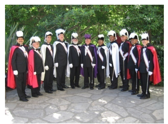
The Color Corps pose for their picture at the Bishop Diego graduation.