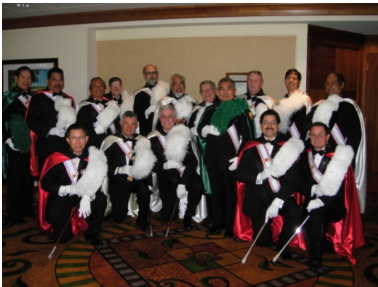
The Color Corps at the Convention pose for their picture.