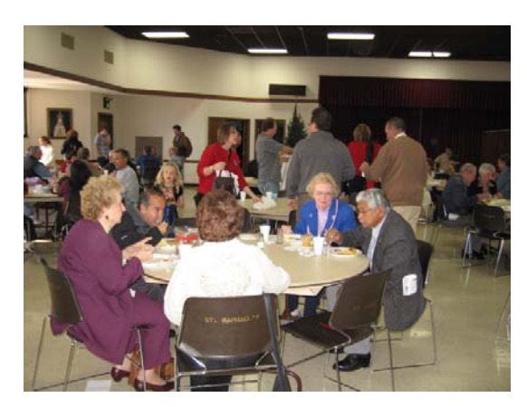
Guests enjoy their pancake breakfast.