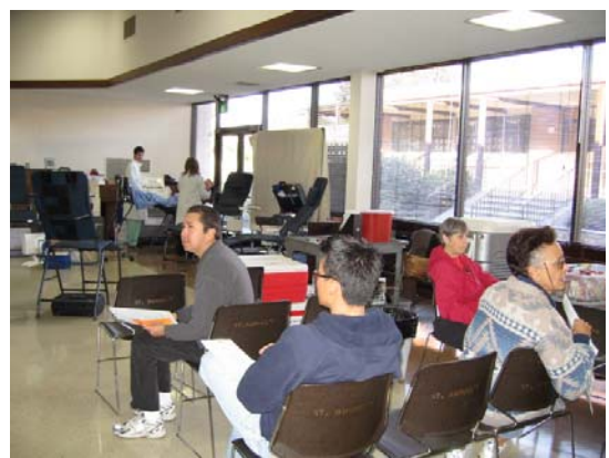
Blood donors wait their turn to give.