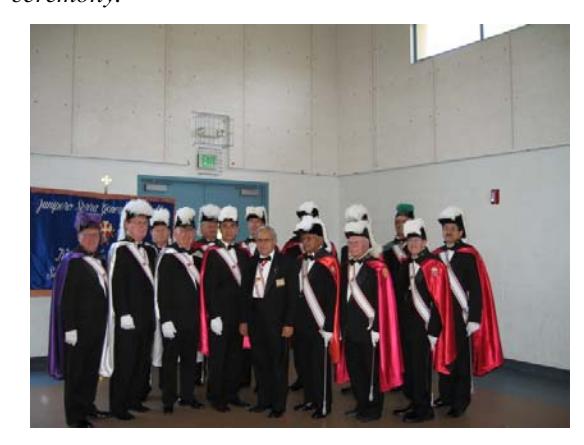
The Color Corps pose for their picture before the certification ceremony that followed the installation.