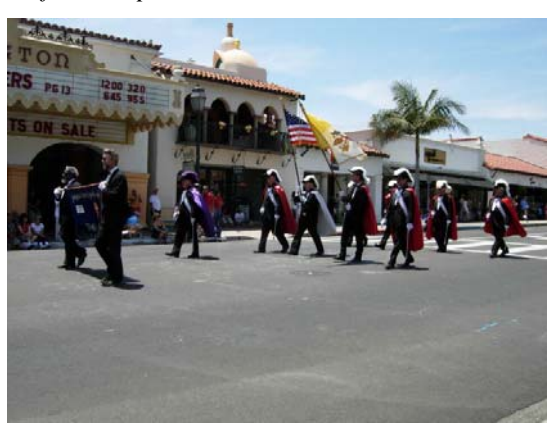
The Color Corps march in front of the Arlington Theatre.