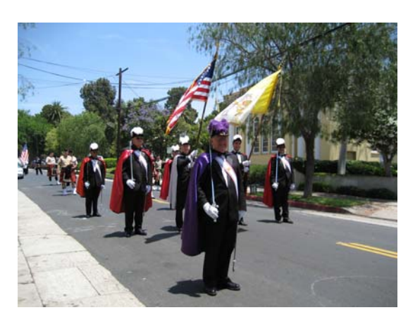
The Color Corps is ready to march down State Street in the Fourth of July Parade.