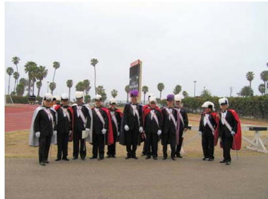
Some of the Color Corps present at the Deacon Ordination pose for their picture prior to the event.