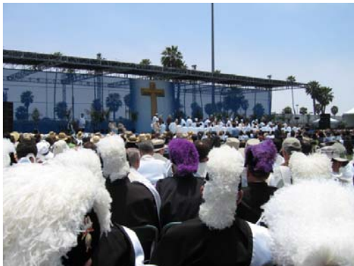
A picture of the deacons during the ordination ceremony.