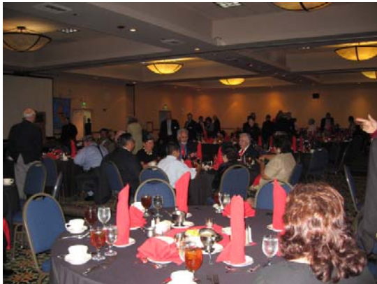
A picture of the DD banquet as the guests were arriving.