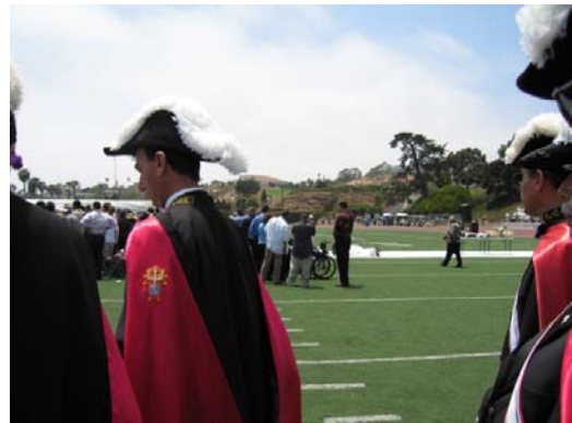
The deacons prostrated themselves before the Cardinal.