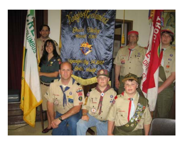
The Boy Scouts pose for their picture in front of the KC 5300 banner