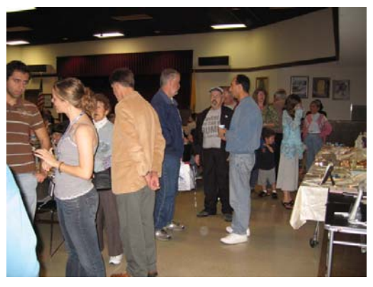
Parishioners line up to be served.