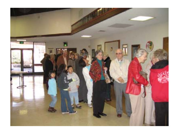
Parishioners from 9:30 mass lined up for breakfast.t