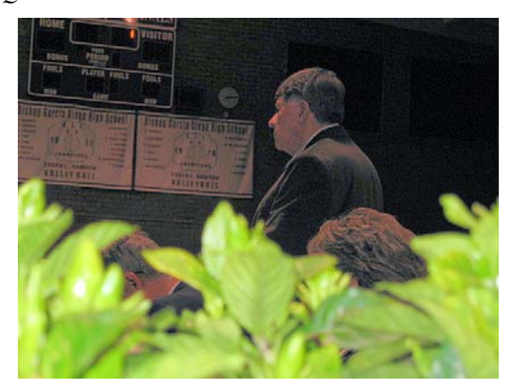
One of the deacons listens while the Catholic Daughters of America read the deacon's prayer.