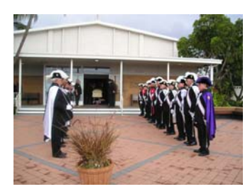
Knights of Columbus Council 5300 Trustees' Christmas Party