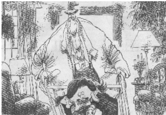
Mommy, Mommy, Grandpa is trying to get my stem cells."

One of the richest sources of cells that are not adult, but more importantly are non-embryonic, is umbilical cords and placentas from live births. Each year, more than 4 million umbilical cords are simply discarded. Connected end-to-end, they would stretch further than from New York to Houston.