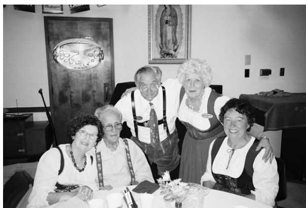
The Alpine dancers.