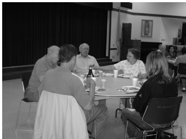
Various guests enjoying their food.