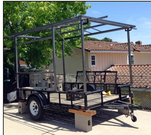
It's Body Begins to Grow