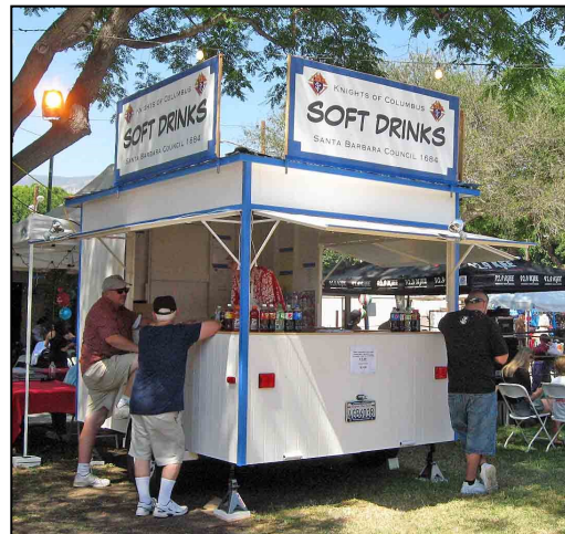
Adulthood - It's Serving the Public