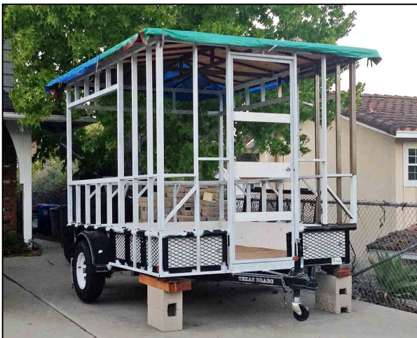
Continuing to Grow Toward Maturity