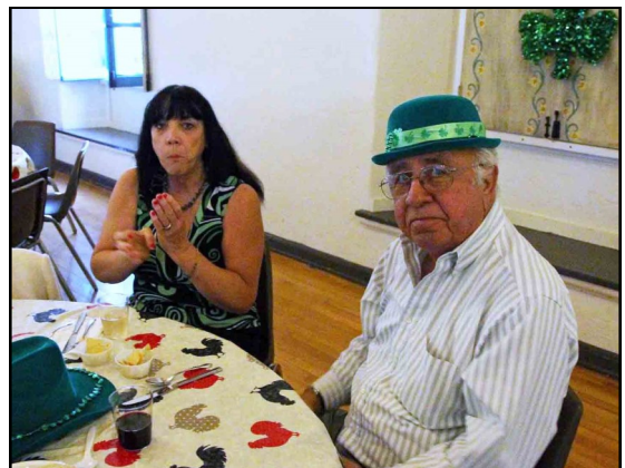
Oh what a handsome looking Irishman.