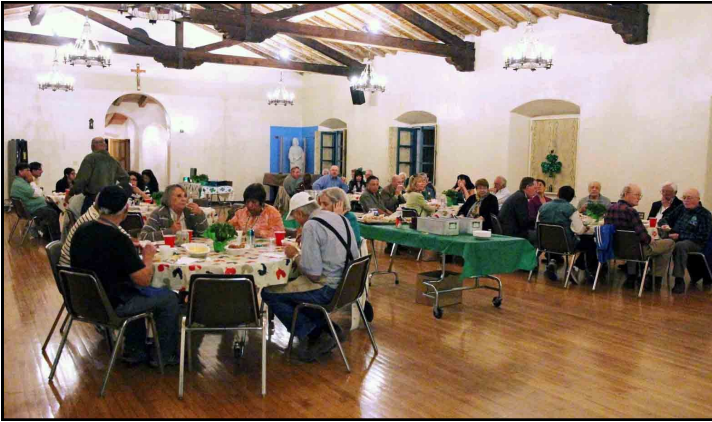
There were 48 people attending the St. Patrick's Day dinner. The food was appetizing and the entertainment was liked.