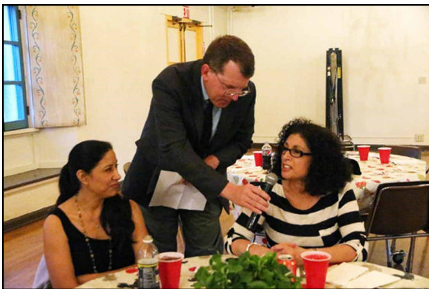
During dinner, our Grand Knight searched for some extraordinary Irish jokes.