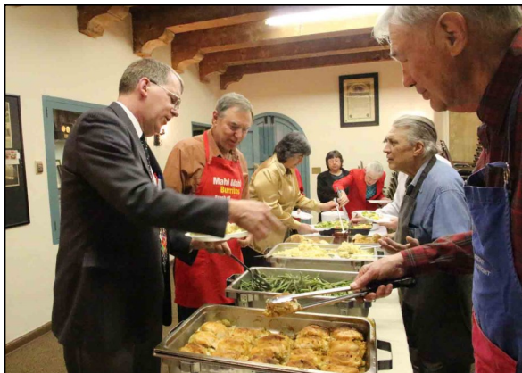
Dinner is served.