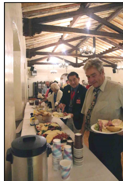
Members, spouses and guests enjoy a light meal together.