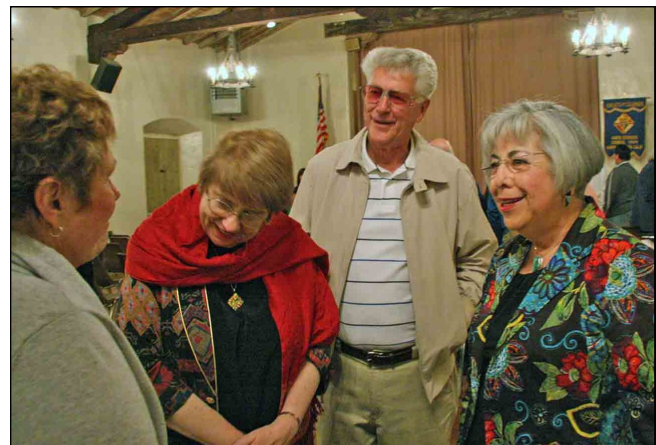
After mass, members and spouses joined in conversation as well as a light meal.