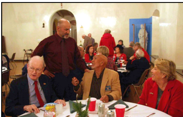
Our Grand Knight makes the rounds talking with members and their wives.

Christmas Dinner photos are continued on Page 9.