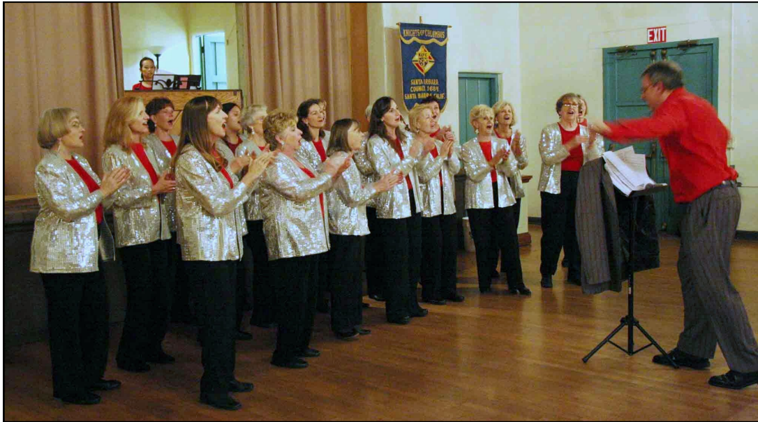
Simply said, these ladies enjoy singing, and they enjoy entertaining the public.