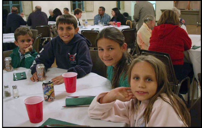
These kids are enjoying the opportunity for having a dinner away from home.