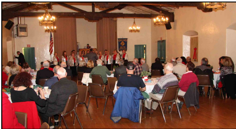
At the Christmas Dinner, everyone enjoyed the variety of Christmas songs sung by the Treble Clef Singers. These ladies have entertained the Knights for the past several years..