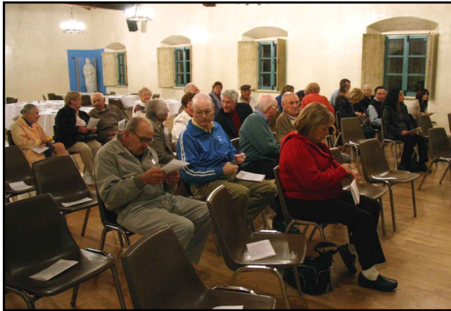
Members of the Catholic Daughters and the Knights wait for Mass to begin.